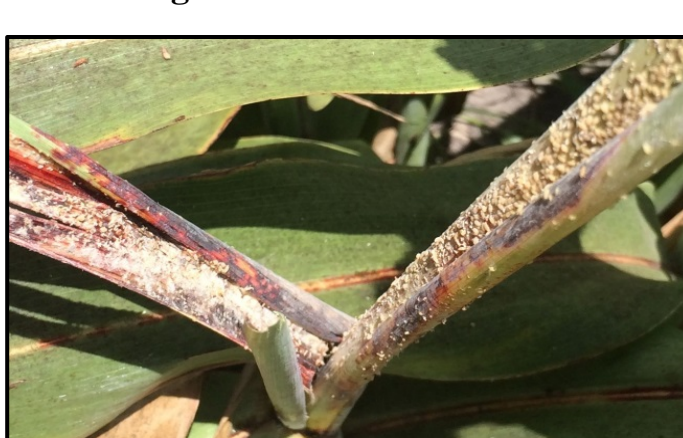
Sugarcane Aphids Under Flag Leaf Sheath

Sorghum maturity ranges from late bloom to mature and harvested. Sorghum that is at or beyond hard dough is considered safe from insect pests. We are watching fields for the sugarcane aphid, stink bugs and