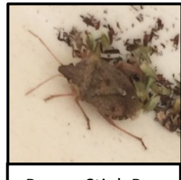
Brown Stink Bug

Sugarcane aphids are appearing in some fields that may be harvested in the next 2-4 weeks. This poses a few tough questions.