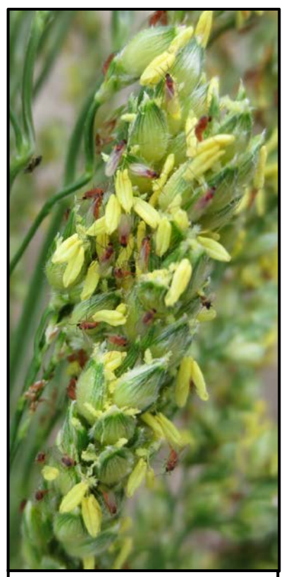
Sorghum Midge

If honeydew production is the concern, treat if aphids are in the head and producing honeydew but remember, a rainfall event could clean up the honeydew