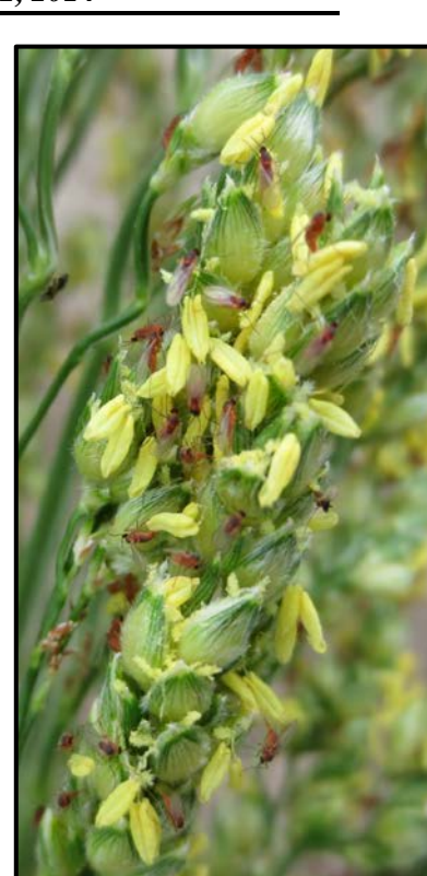
Sorghum Midge, Courtesy of Danielle Sekula

Inspect plants along field borders first; particularly those downwind of earlier flowering sorghum or