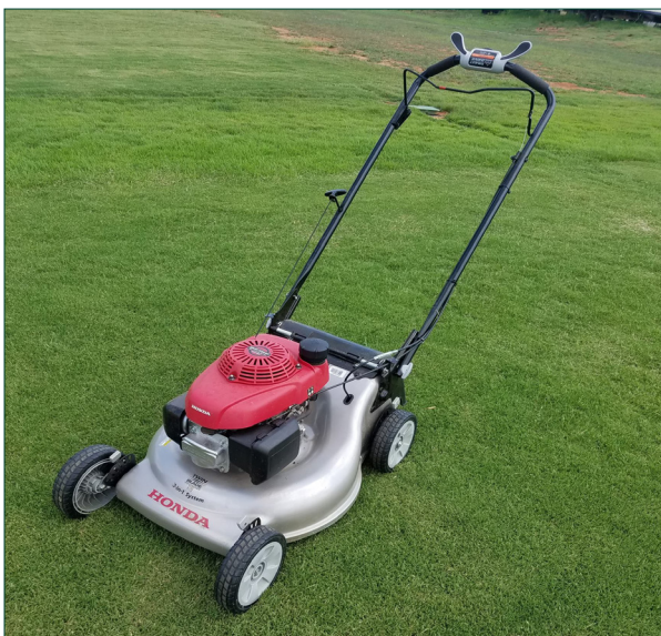
FIGURE 3. Proper mower maintenance is critical to maintaining healthy, viable turfgrass. Take time to keep mower blades cleaned and properly sharpened.

It is important to properly maintain any equipment that is being used to manage a turfgrass area. Dull mower blades will not cut grass properly and may cause injury by crushing, shredding, or leaving jagged, uneven cuts on turfgrass leaf blades. These injuries will increase turfgrass susceptibility to pests including diseases and insects and will ultimately compromise turfgrass response to other environmental stresses such as drought or heat. Most mower blades can be sharpened at home or professionally. Use caution when sharpening mower blades to avoid the risk of injury. Always turn off mowers and remove the spark plug prior to maintenance.